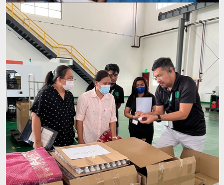
Assessors from Bureau Veritas during facility tour

The audit included a facility tour, document review, and individual and group interviews of workers. While there were minor nonconformities raised during the audit, the Kaertech Leadership Team took this as opportunities to improve the processes, systems, and business practices within the company.