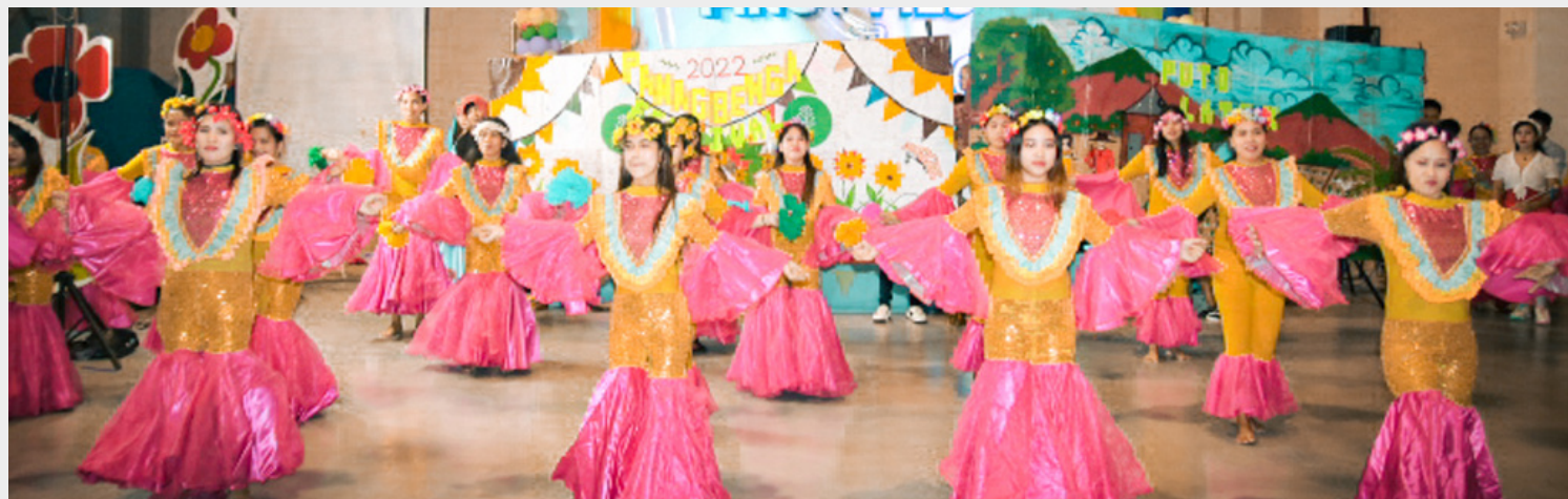
Team Luzon's Winning Costume and Dance Performance during Kaertech's Year-End Party