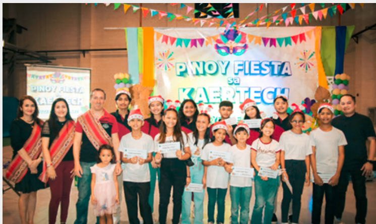
Kaertech Managers with Parish Youth Choir

As part of the company's Corporate Social Responsibility (CSR), a group of twelve children, called the Parish Youth Choir, together with their youth leaders received cash donations during Kaertech's Year-end party. These children are from a small community in Real, Calamba City who were heavily affected by Typhoon Paeng last October 2022. The group is part of the Parish Music Ministry in San Vicente Ferrer Parish - Real. The Parish Youth Choir was formed during Dalaw Patron sa Kapitbahayang Katoliko (DPKK) wherein the parish priest and volunteers, went to secluded areas and communities to provide spiritual and physical needs. These kids have since been discovered and they now show their commitment by singing every Sunday during service and performing in every Parish events. The kids have shown diligence in attending practices while doing their responsibilities at home and in school.