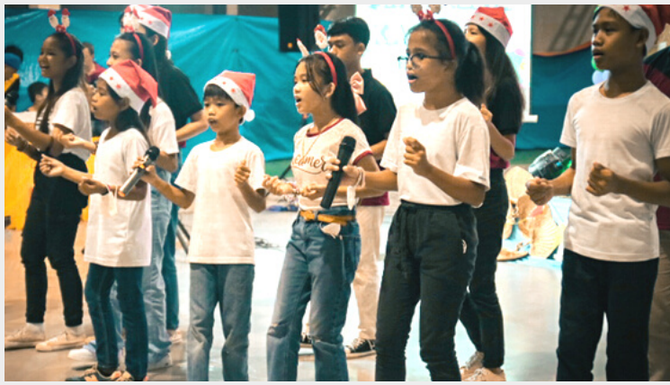
Parish Youth Choir singing Christmas carols during Kaertech's Year-end Party