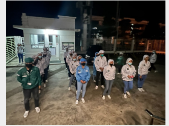
Employees evacuating the building

Company's annual fire evacuation drill was conducted last December 20 and 21, 2022 for the two buildings. The drill was facilitated by the Environment, Health, and Safety (EHS) Committee.