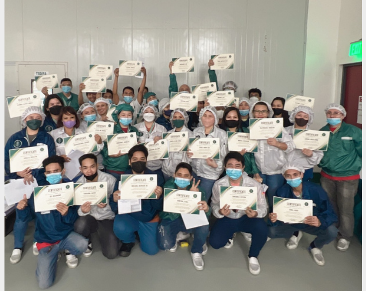
Employees receive their Certificate of Appreciation for demonstrating commitment to work amidst the Typhoon Paeng (Nalgae).