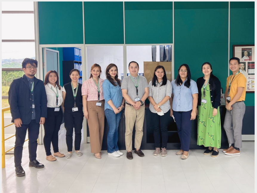
Kaertech SMETA Core Team with the Bureau Veritas Auditors