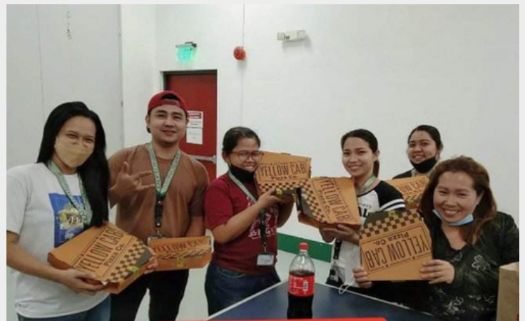
Employees received a simple gift for working on Christmas Day.