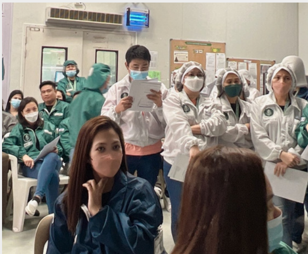
Employees attending the training