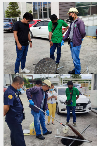
Sewage testing conducted by LTI Laboratory Inc. and Laguna Water

Consistent with the company's efforts in meeting compliance obligations to regulatory requirements, the water discharges from Kaertech's two buildings were tested last December 15, 2022. This was conducted as part of the company's continuing compliance to Laguna Lake Development Authority's (LLDA) requirement.