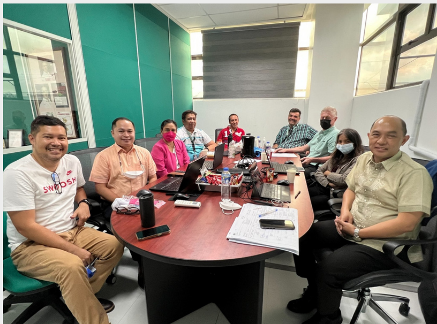
Kaertech Leadership with the SGS Auditors during the closing meeting of ISO 9001 and ISO 13485 audit held last May 28, 2022