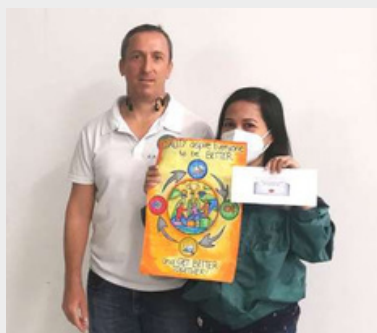
3rd place winner of the Slogan and Poster Making Contest (QEHS Department)

"The cycle represents a guide or method to use in order to achieve continuous quality improvement. We have to PLAN, DO, CHECK & ACT together to provide a simple and effective approach for solving problems and managing change."