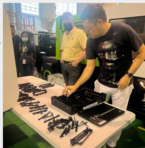
Kaertech has been certified to ISO 9001 and ISO 13485 since 2016 and 2018, respectively

Kaertech successfully renewed its ISO 9001:2015 Quality Management System and ISO 13485:2016 Medical Device Quality Management Certificates last May 24-28, 2022. The combined audit was facilitated by SGS Philippines, Inc. This year's audit also included extending the scope to include Manufacture of Plastic Molded Parts.