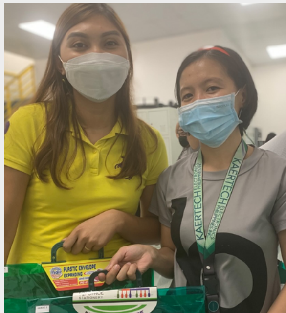
Employees received the school supplies