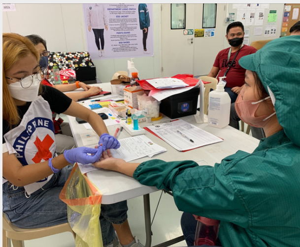
Employee volunteers undergoing blood typing