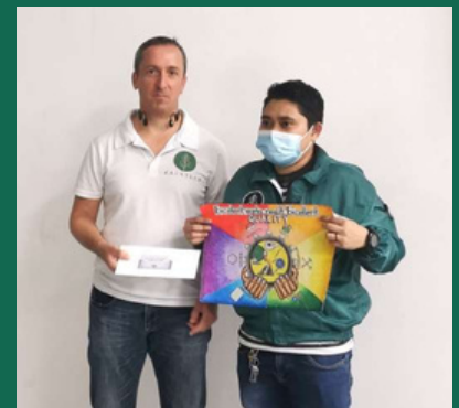
2nd place winner of the Slogan and Poster Making Contest (Manufacturing Department)