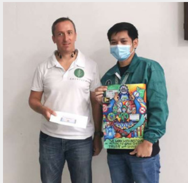
Winner of the Slogan and Poster Making Contest (TSD Department)

In order for the employees to appreciate and commit to the messages that were illustrated by the participants, all the entries and the explanations of the slogans and posters have been framed and will be hung in the company walls.