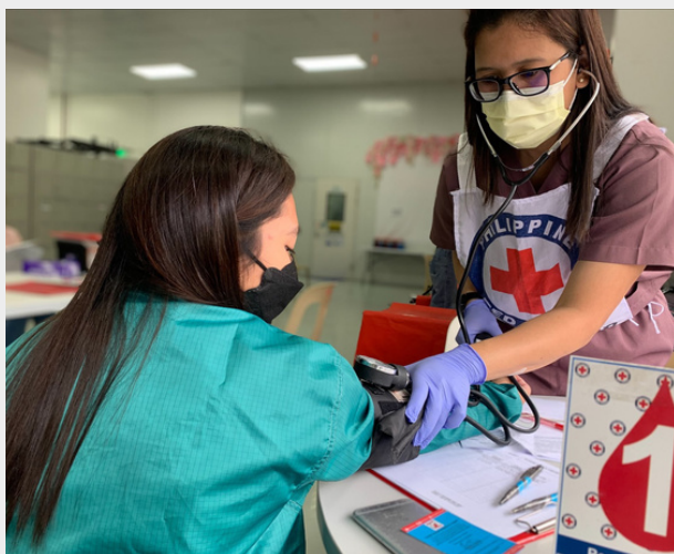
Employee volunteers undergo screening to ensure eligibility to donate blood

In partnership with the Philippine Red Cross (PRC), Kaertech Electronics Philippines Inc. conducted a Blood Letting Activity last August 11, 2022. A total of 23 donors participated. Prior this, an orientation was facilitated by PRC to educate the donors of the benefits of bloodletting and how this helps in saving lives. This activity aims to promote the spirit of volunteerism among its employees and in-house service providers consistent with the company's drive for Corporate Social Responsibility.