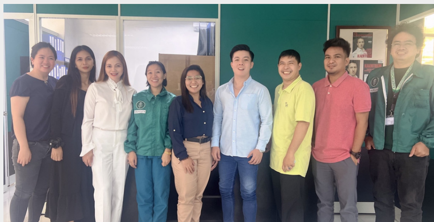
Participants of the ISO 14001:2015 Training

Kaertech aims to be certified to ISO 14001:2015 by first half of 2023.