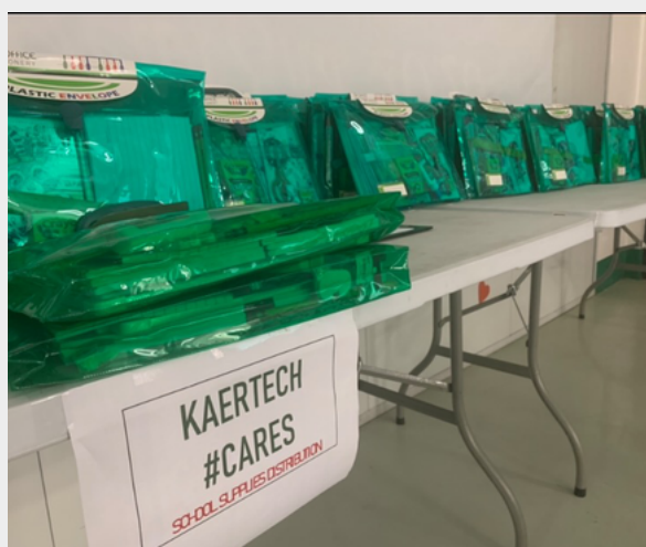
School supplies prepared by the company

Schools have finally decided to reopen in September 2022 after almost two years of kids being educated from home. In line with this, Kaertech gave away school supplies for the children of the employees from Kinder to 6th grade. A total of 51 kids received the school supplies last August 12, 2022.