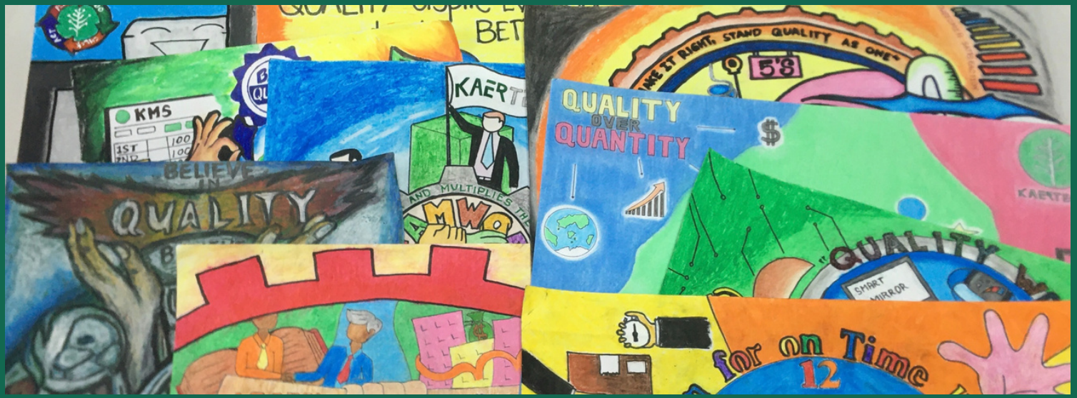
All entries from the participants in the contest